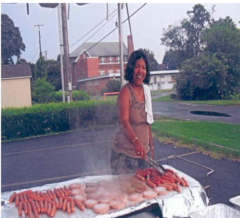
And you thought I only directed THE music??