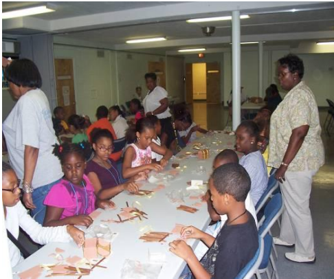
Where's the glue!!

We have had so much fun at GMBC Vacation Bible School. The organizers and volunteers were thrilled to be a small part of what God had done for our visitors.