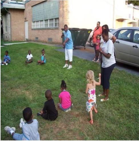
Do you think anyone would notice If I stopped running?!!