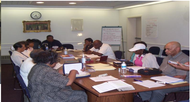
There's a class for every age at Goodwin's VBS

And it truly was an amazing week! Each day there were no less than 100 visitors from the community attending classes. The first day brought in 107 children and by Thursday we were up to 148 in attendance. The average count each day for the Teens was 40, with adults coming in at approx 20. What a blessing to see so many come out each day even though heavy rain descended on us from Wednesday to the end of the week.