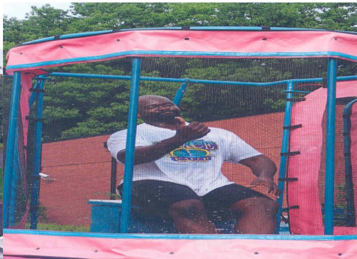
Hey, Heyy!!! You missed....AGAIN!!