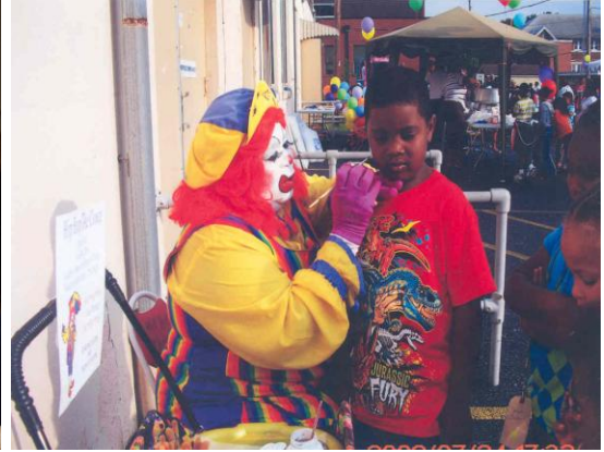
Please Mr Hip Hop... Don't make me look like you!!